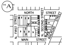
ENLARGEMENT OF DOWNTOWN AREA